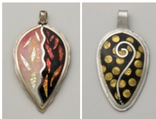
transparents over opaques and foils---fired in kiln