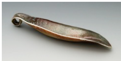
torch fired AS