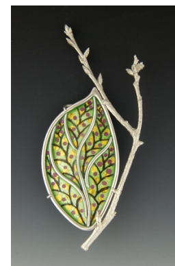
AS frame, wires, & setting with enamel over fine silver